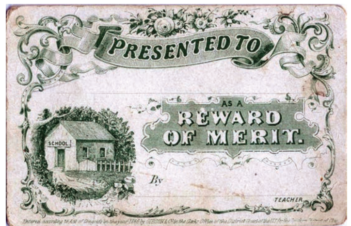
Reward to Merit card, 1866 (HLCM collection: 2008-25/14)