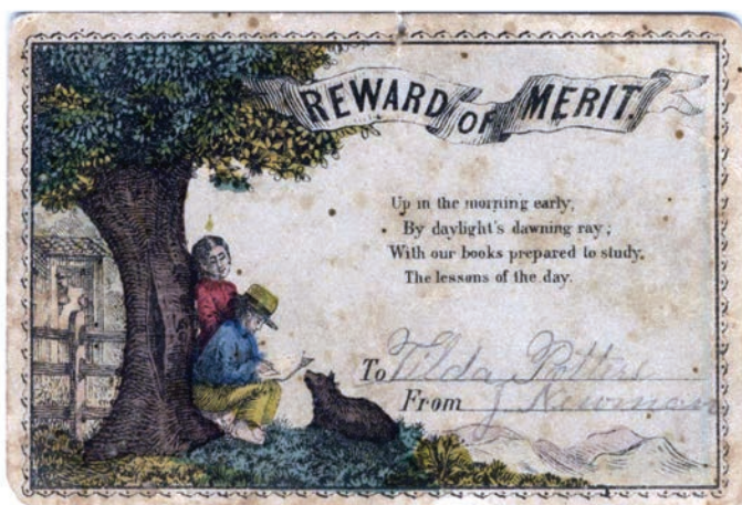
Reward of Merit card to Tilda Potters from J. Newman (HLCM collection: 2004-7/33)